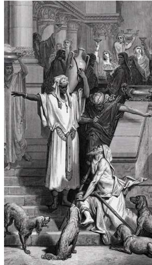
The parable of the rich man and Lazarus – Luke 16.19-31

Our Mission: We are a Catholic Parish in Prince Edward County committed to proclaiming the Good News of Jesus Christ.