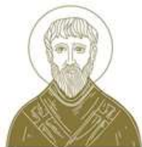
Saint Gregory the Great (540–604)

Sanctuary Lamp is for the spiritual and material needs of the Parish.